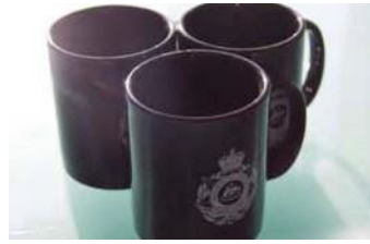
Gloss Mug | $17.00