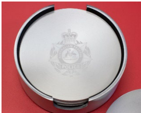
Coaster Set | $40.00