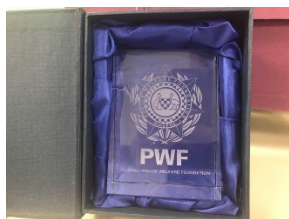
PWF Plaque (Glass) | $85.00

See over the page for the Merchandise order form