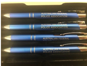
AFPA Pen | $10.00 each