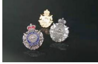
Tie Tac (coloured, silver, gold) | $10.00