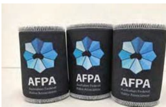
AFPA Stubby Holder | $7.00