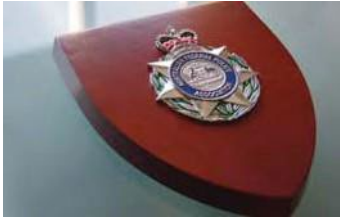
Coloured Shield Plaque | $70.00

AFP Merchandise items Please call 02 6285 1677 to confirm stock levels.