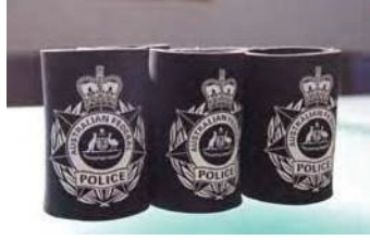
Stubby Holder | $10.00