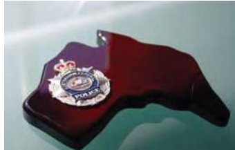
Australia Plaque | $70.00