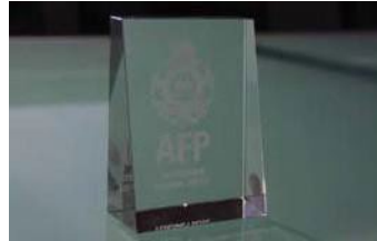
AFP Plaque (Glass) | $70.00