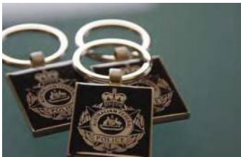
Key Ring | $18.00