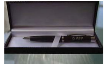
Pen | $20.00