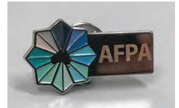
AFPA Lapel Pin | $7.00