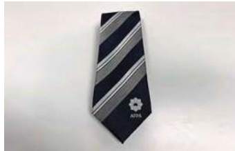
AFPA Tie | $25.00