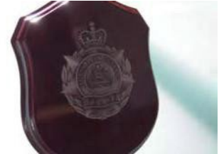
AFP Plaque (Pewter) | $70.00