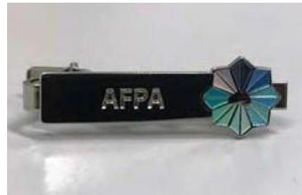
AFPA Tie Bar | $12.00